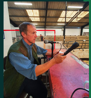
Auctioneer using the Digital Gavel